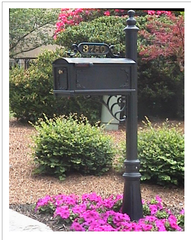
The mailbox is called the "Provincial" installed by Mailbox Makeovers.

If you haven't purchased a new mailbox, you still can! We're asking all interested homeowners to contact Homeside Properties and make your order. We will likely collect and do orders in groups of 20+ since you will get a $20 break at 20